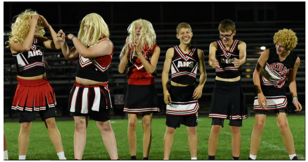
Powder Puff Cheerleaders