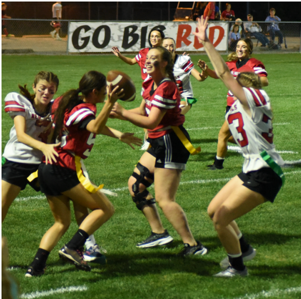
Powder Puff Players