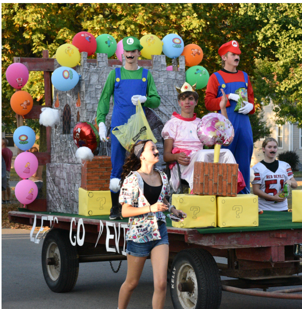
Homecoming Parade