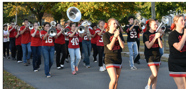
Homecoming Parade